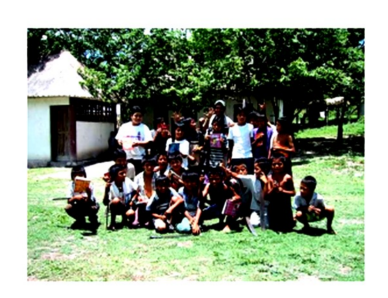
In "Uaxactun" – One of the communities where palms have been gathered for years

Many "kingly" words will be used during our singing today— as we praise Jesus, our King.